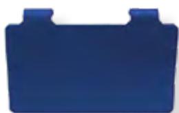
Interlock® Plastic Tags INO1968