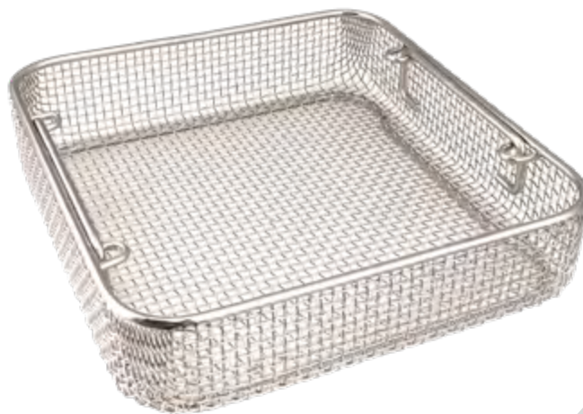
DJ-4413 240mm x 250mm x 60mm