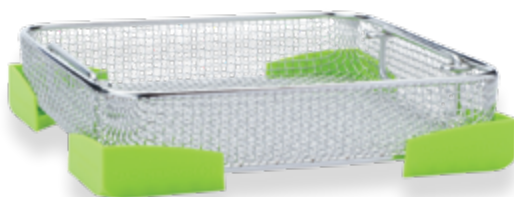
Key Surgical® Surgical Tray Corner Protector CS-9113