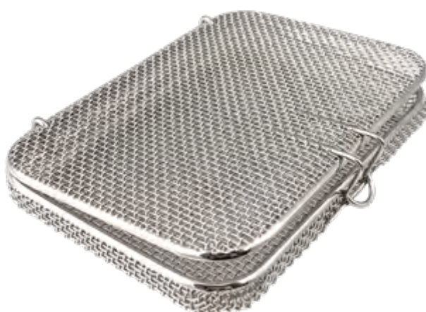
150mm x 110mm x 20mm DJ-4350