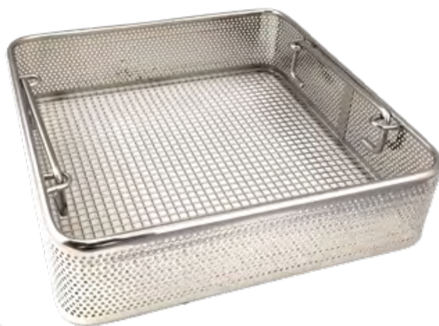
DJ-4550 240mm x 250mm x 60mm