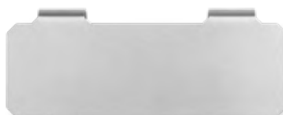
Interlock® Metal Tags INO1449