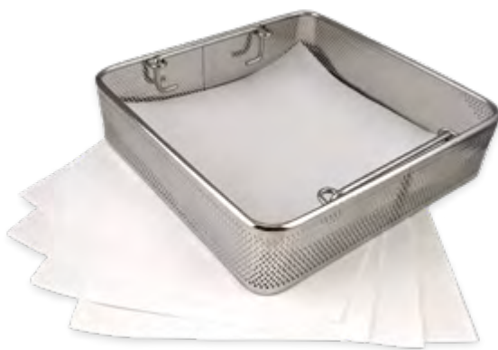
Clinipak® Tray Liners Sheets TLC009