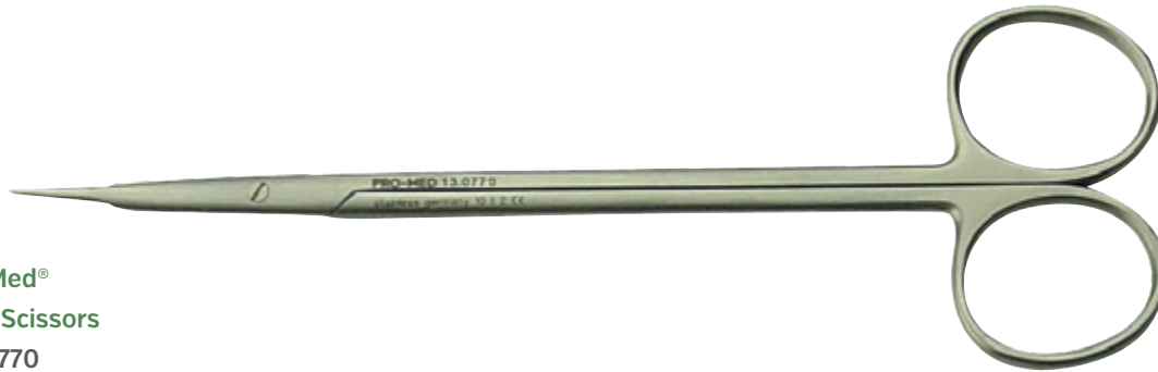
Pro-Med® Reynolds Scissors 13-0770