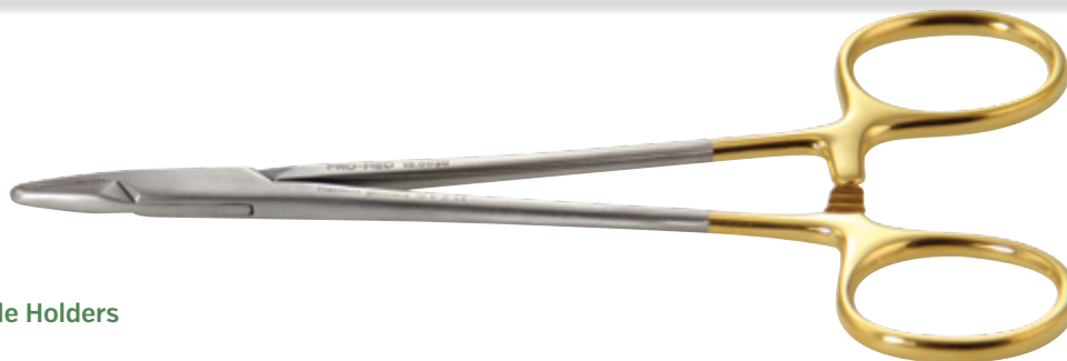
Pro-Med® Baumgartner Needle Holders 18-0030