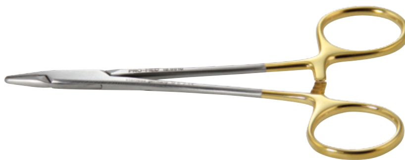
Pro-Med® Derf Needle Holders 18-0010