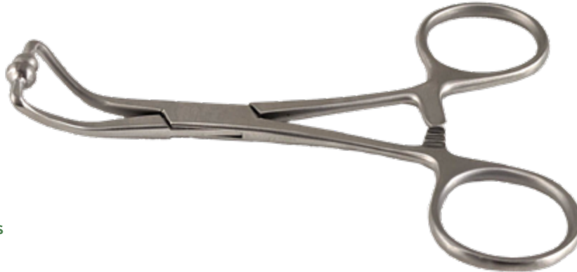
Pro-Med® Ball & Socket Forceps 16-0132