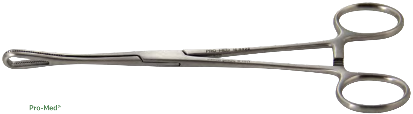
Pro-Med® Rampley Sponge Forceps 16-0422