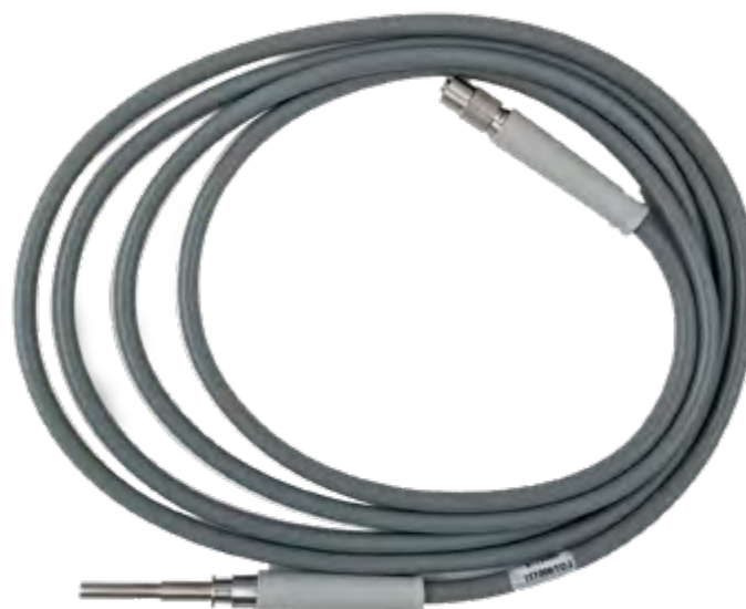
Gulf Fibre Optic Cables 473.030-GY