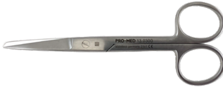
Pro-Med® Operating Scissors 13-0300