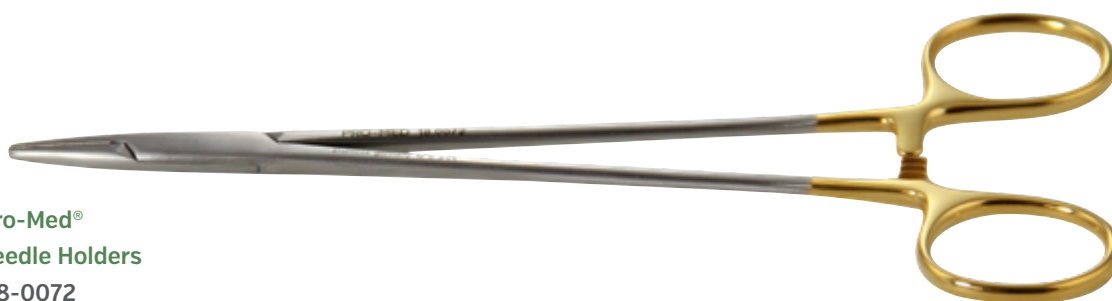
Pro-Med® Crile Needle Holders 18-0072