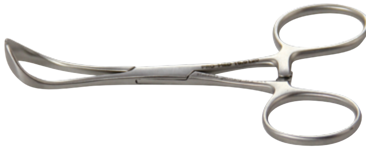
Pro-Med® Lorna (Edna) Towel Forceps 16-0120