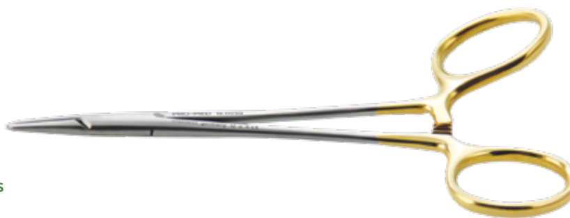
Pro-Med® Neivert Needle Holders 18-0050