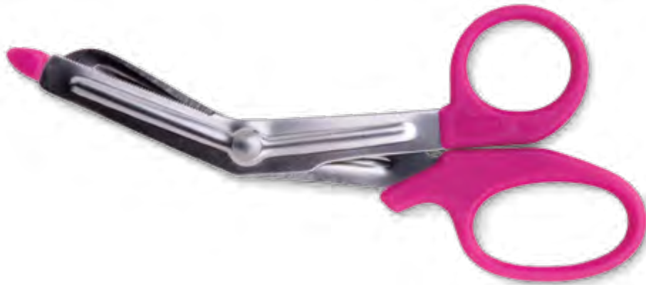
Key Surgical® Small Universal Scissors KS-065