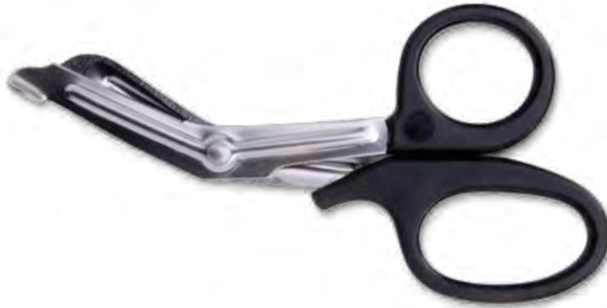
Key Surgical® Large Universal Scissors 13-5001