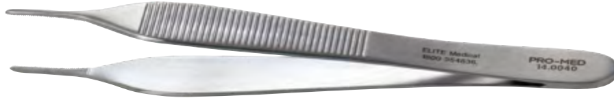
Pro-Med® Adson Dressing Forceps 14-0040