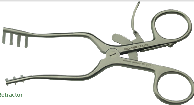
Pro-Med® Weitlaner Self-retaining Retractor 17-5302