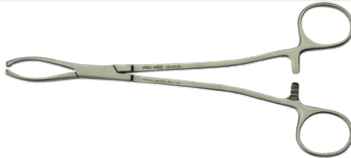
Pro-Med® Littlewood Tissue Forceps 48-0035