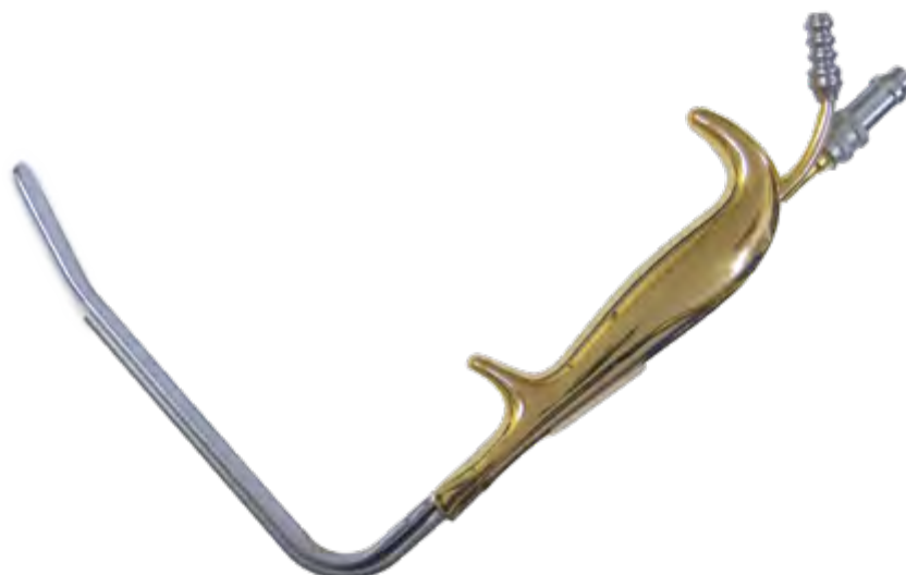
Pro-Med® SCULPO Breast Retractor 17-3033