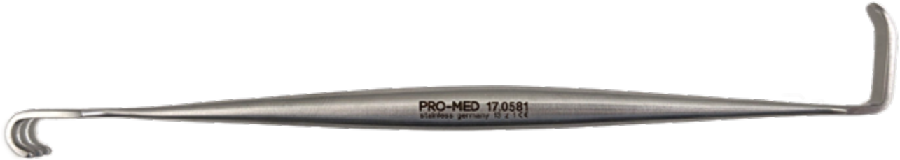
Pro-Med® Sen-Miller Retractor 17-0581