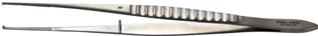
Pro-Med® Gilles Tissue Forceps 14-0570