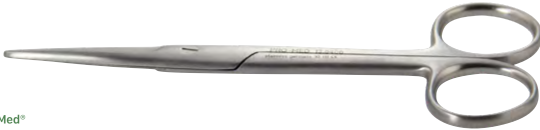
Pro-Med® Mayo Scissors 13-0400