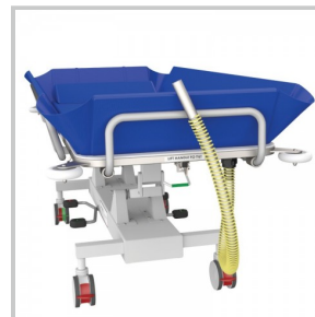
Wide top option