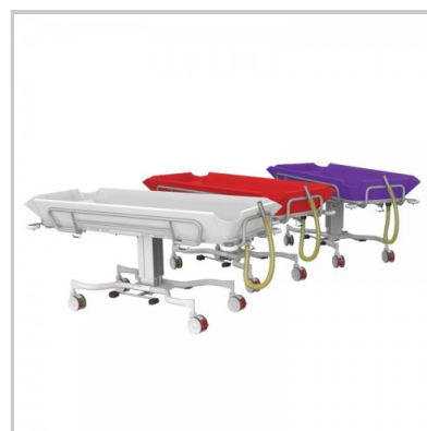
Custom Liner Colours