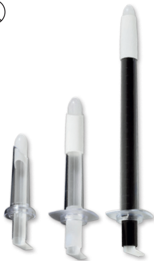
85x20mm 130x20mm 250x20mm