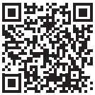
HEINE DELTA 20T film