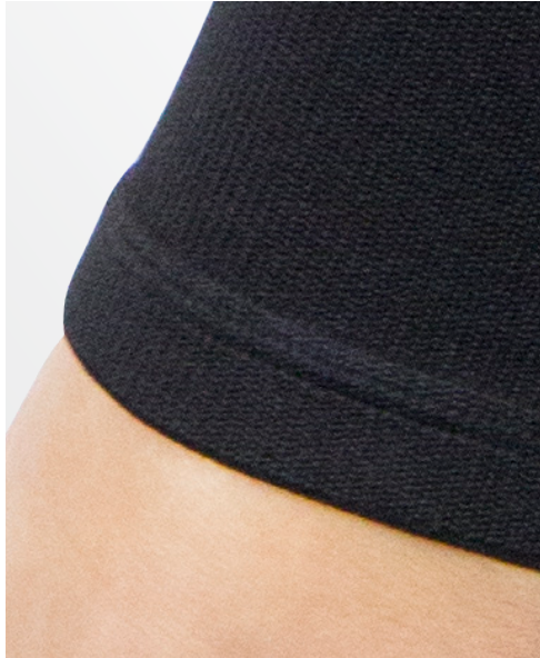
Non-binding ankle cuff stays comfortably in place for all day wear

The perfect pair of leggings to keep your legs looking great and feeling great every day!